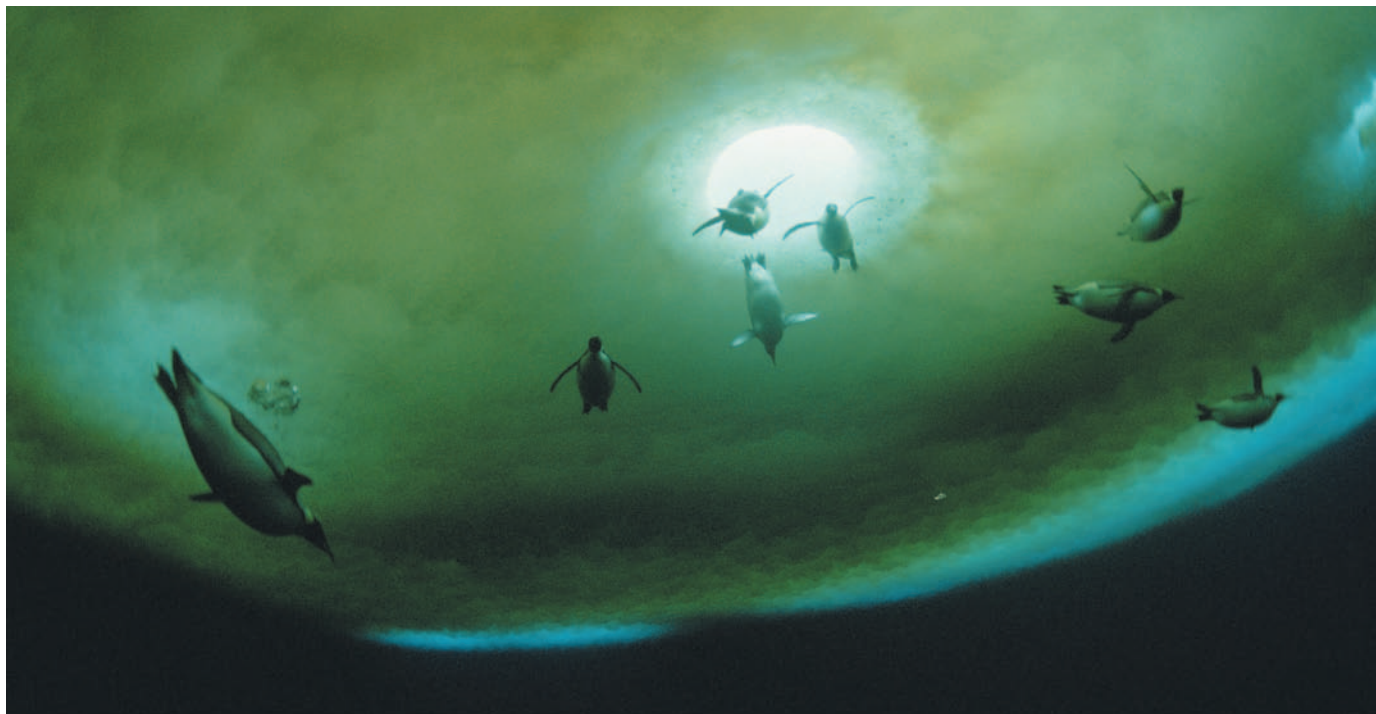
Emperor penguins dive under a breathing hole in the Antarctic sea ice, which provides a platform for marine life.

remote observatories and better ways to store and uplink data will be needed. Improved computer models are essential for portraying the highly interconnected Antarctic and Earth system if we are to improve forecasts.