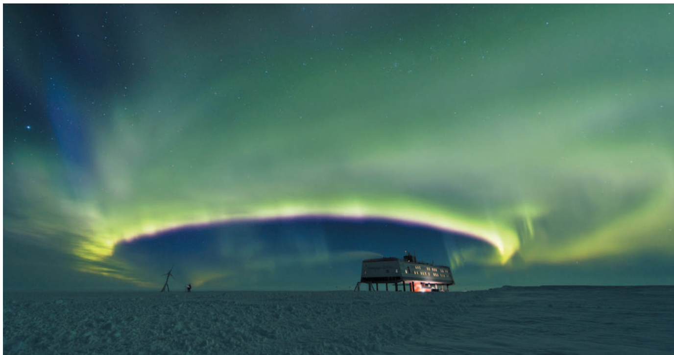
The aurora australis over the German Antarctic research base, Neumayer-Station III.